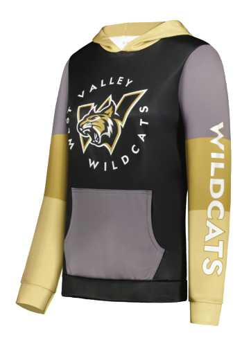
Color Block III