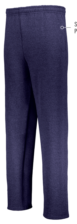
Side Seam Pockets