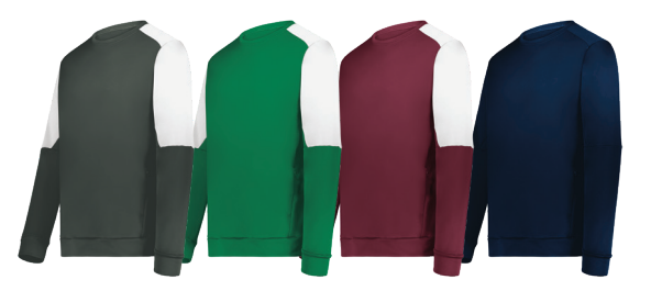
DARK GREEN/ WHITE 438