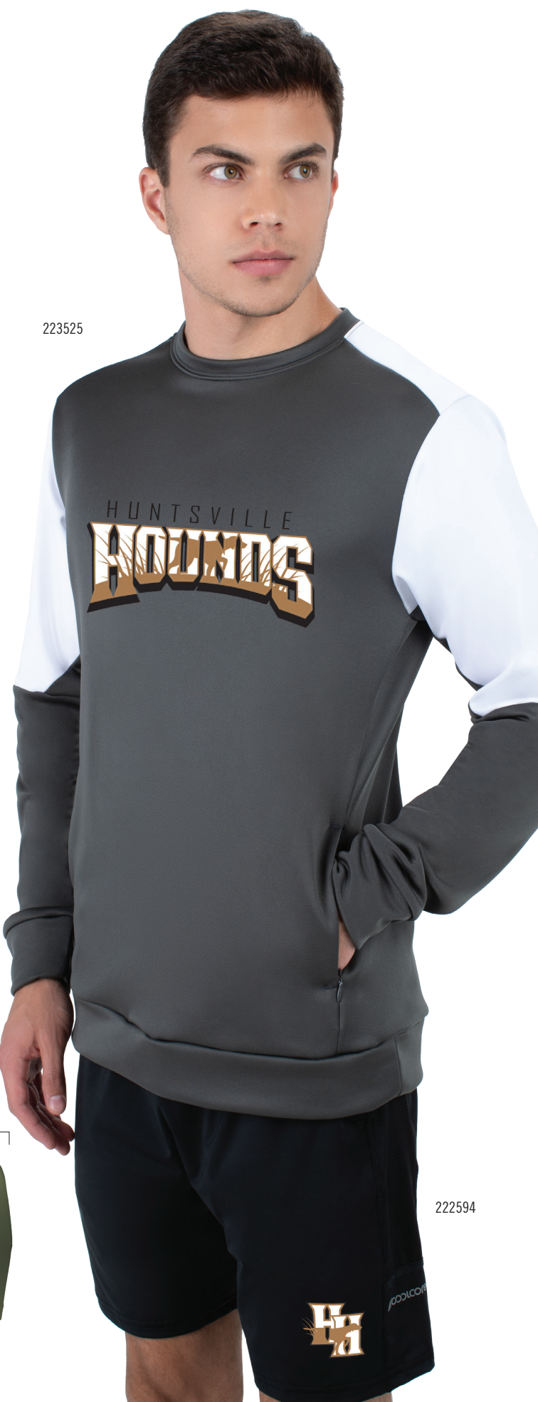
OLIVE 039 IRON